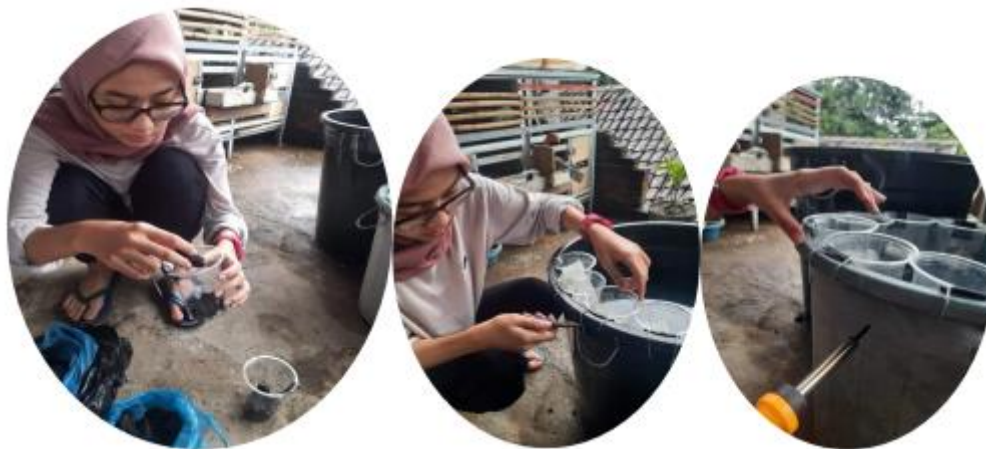
Figure 3 The process of making Budikdamber . (left) filling a glass with charcoal and tissue; (middle) hooking the glass into the bucket and (right) punching holes in the bucket with solder

Step by step techniques for making Budikdamber as shown in Figure 3 as follows: 1) preparing vegetable planting media, 2) punching 10 plastic cups with soldering iron, 3) cutting the water spinach plant and left over the bottom part, 4) inserting the water spinach into the glass, 5) the glass is filled with coconut shell charcoal between 50 and 80 percent of the size of the glass, 6) cutting the wire to approximately 12 cm, 7) making hook model as a glass holder on a bucket. Next is the preparation of the media for Budikdamber , including: 1) Filling the bucket with 60 liters of water and allowed to stand for approximately 1 to 2 days, 2) putting catfish seeds in a bucket, 3) Assembling a glass of water spinach and placed on the edge of the bucket.