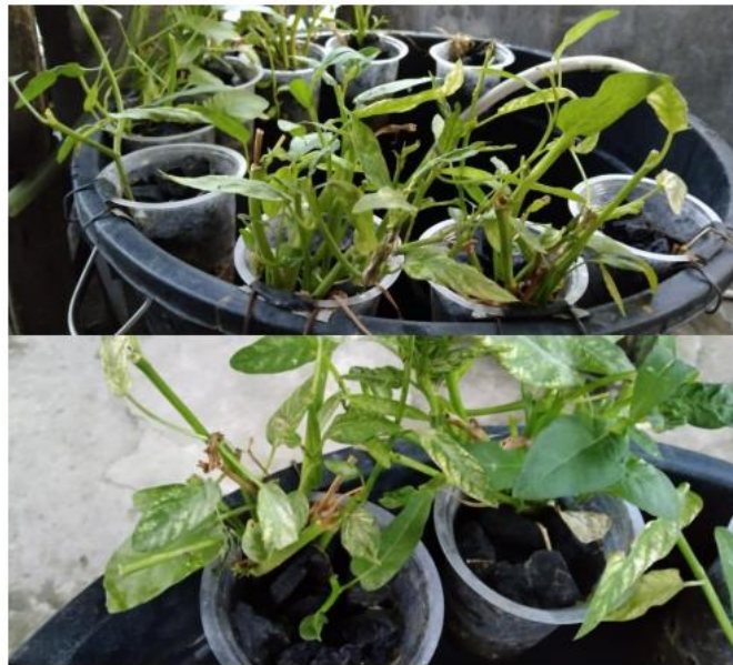
Figure 5 Less-quality Kangkung (Requiring a New Nursery)

Figure 5. Meanwhile, catfish that has reached a suitable size for consumption must be immediately separated from the cultivation bucket.