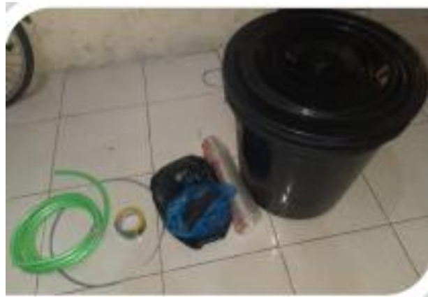
Figure 2 Tools and materials needed for Budikdamber (bucket, hose, plastic cup, wire)

Step by step techniques for making Budikdamber as shown in Figure 3 as follows: 1) preparing vegetable planting media, 2) punching 10 plastic cups with soldering iron, 3) cutting the water spinach plant and left over the bottom part, 4) inserting the water spinach into the glass, 5) the glass is filled with coconut shell charcoal between 50 and 80 percent of the size of the glass, 6) cutting the wire to approximately 12 cm, 7) making hook model as a glass holder on a bucket. Next is the preparation of the media for Budikdamber , including: 1) Filling the bucket with 60 liters of water and allowed to stand for approximately 1 to 2 days, 2) putting catfish seeds in a bucket, 3) Assembling a glass of water spinach and placed on the edge of the bucket.