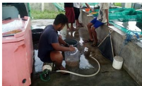
Figure 5. Larvae packed (after masculinization with MT)

Next is the provision of MT (Methyl Testosterone). Based on [9], This chemical substance serves as a hormone to make fish males because, at the time of enlargement for fish consumption, male fish are used. The growth enhancement was more effective in masculinized fish.