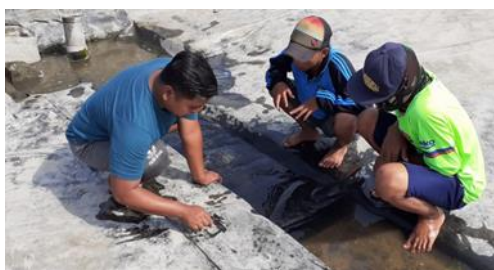
Figure 7. Harvest of seeds

After ten days or more of the seeds being harvested, the pond is first drained by replacing the drainpipe with a hollow pipe so that no seeds can escape. While waiting for low tide, the pond is cleaned using water mop so that when the seeds are taken, the water is clean. Like harvesting larvae, seeds are not given food for a while before harvesting. After the water recedes and is clean, the seeds will collect in the middle channel. Then the seeds are herded with a net to the water tap. After it is felt enough is collected, the seeds are taken with a seed and put in a tub filled with water. For seeds, it does not matter if the water in the tub is not too much. It also makes it easier for the transport process to handling because the fish cannot jump out of the tub.