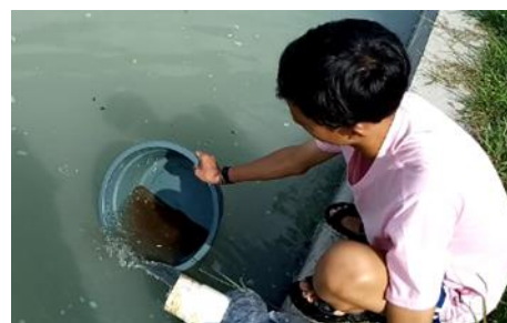
Figure 6. Larvae nursery

Nursery is the rearing of red tilapia from the hatchery before being released at the rearing place. The nursery for red tilapia is not much different from other fish. Nursery aims as a medium for adapting seeds to the environment before they are spread in an enlargement pond [4].