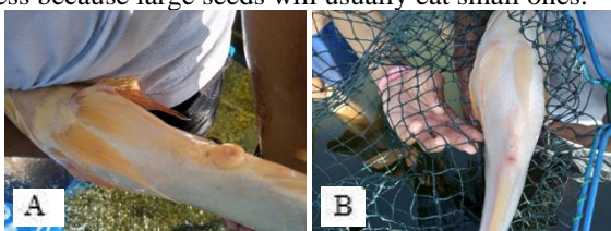
Figure 2. (A) Male and (B) female fish

To produce superior seeds in quality and quantity, it is very dependent on the broodstock [8]. Before being spawned, the male and female sires are separated (bent) for 10-14 days. It aims to ripen the parent hormones and sterilization, especially for female sires, to ensure that no eggs are stored in their mouths. Because the purpose of spawning here is mass spawning, so all brooders must ensure that the spawning time is the same. Besides, to minimize the uniformity of larvae/seed size produced. Non-uniform seed sizes interfere with the spawning process because large seeds will usually eat small ones.