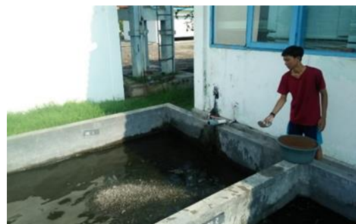
Figure 3. Simple fish pond

Feeding during spawning decreases every day because the female sires have incubated the eggs/larvae in their mouths [9]. Feed that should be 800 grams will reduce to 500 grams in one feed. The feed given is artificial feed with the type of 782, which contains 29-31% protein, 4% fat, 5% fiber, 13% ash content, and 12% moisture content. In the afternoon, the feed will be reduced again because the fish appetite has decreased due to organic food, namely photosynthetic phytoplankton during the day.