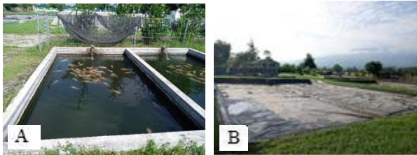
Figure 1. (A) Spawning Pond (B) Nursery Pond

Before spawning, the pool is prepared first by cleaning it from any remaining dirt or moss. Once clean, the pond is filled with water with a depth of 50 cm. The water should be flow continuously to prevent silting due to evaporation. Clean water supports the results of red tilapia spawning. Therefore, water quality parameters also need to be considered.