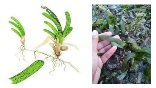
Figure-4. Thalassia hemprichii

Enhalus acroides [5]. This type of seagrass has a smaller morphology of leaves so that it can be more numerous compared to seagrass species that have large leaves [7]. Thalassia hemprichii leaf strands are ribbon-shaped with rounded ends and there are brown lines or patches on the surface. On each stand there are 2-5 leaves with a leaf length of 6-30 cm and a width of 5-10 mm [8].