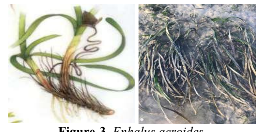
Figure-3. Enhalus acroides

The dominance of Enhalus acroides (Figure-3) in the waters of Tunggul Beach is inseparable from the characteristics of its habitat that lives in sandy or charcoal sand substrates [5], according to the substrate of Tunggul Beach which tends to be charcoal sand, although there are some points with sandy clay or fine sand substrates. Enhalus acroides have thick, wide leaves, and a length of up to 1 meter so that it has room for larger photosynthesis. [6] states the morphology of seagrass species in the form of upright plants with long leaves and large enough, supporting its ability to have high resistance to various environmental conditions. Seagrass Enhalus acroides have larger roots compared to other species and are able to survive in waters that tend to be murky or muddy.