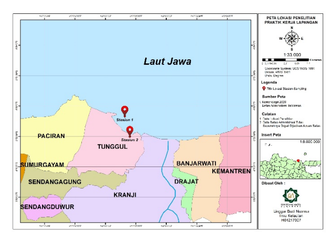
Figure-1. Research site