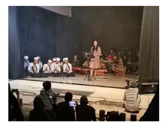
Figure 2 Interfaith Collaborative Arts Performances