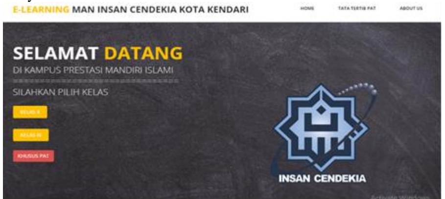
Figure 1. Initial view of E-Learning Madrasah

The Madrasah E-Learning application issued by Kemenag RI as a whole has fulfilled the needs of madrasah ranging from teachers, students, teachers BK, class guardians and head of Madrasah. The first thing to do is to install the local server by the Madrasah operator, the next operator's task is to set the user who can login into the e-learning Madrasah and set the lesson year also the active semester. Here is the initial look at the e-learning Madrasah MAN Insan Cendekia City of Kendari.