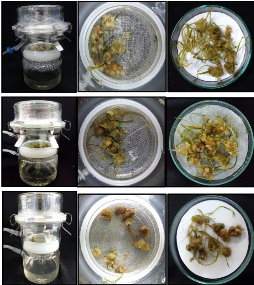
Fig-2 G. procumbens callus cultured in temporary immersion bioreactor after 28 days under treatments of various sucrose concentration (3%, 5%, 7%) and immersion frequency of 15 min at 12 h interval.