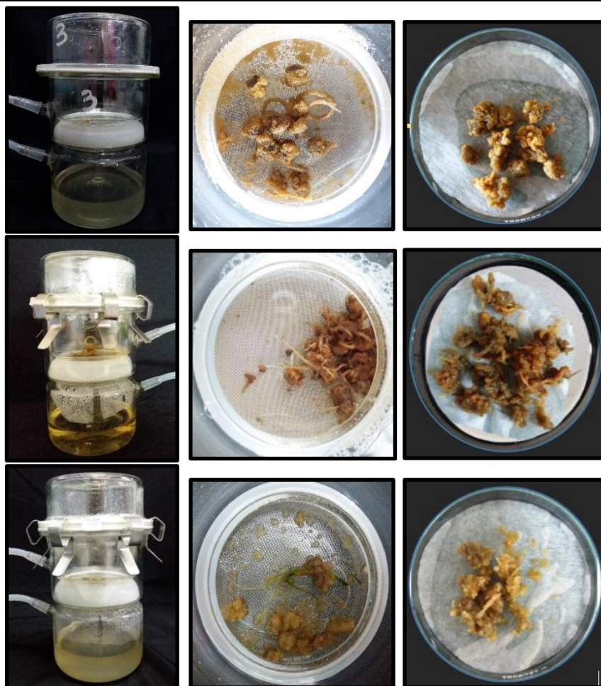
Fig-2: G. procumbens callus cultured in temporary immersion bioreactor after 28 days under treatments of various sucrose concentration (3%, 5%, 7%) and immersion frequency of 5 min at 3 h interval

The highest total flavonoid content (kaempferol and quercetin) was obtained in the combination treatment of 7% sucrose and 15 min immersion at 12 h interval, while the lowest total flavonoid content was found in the combination