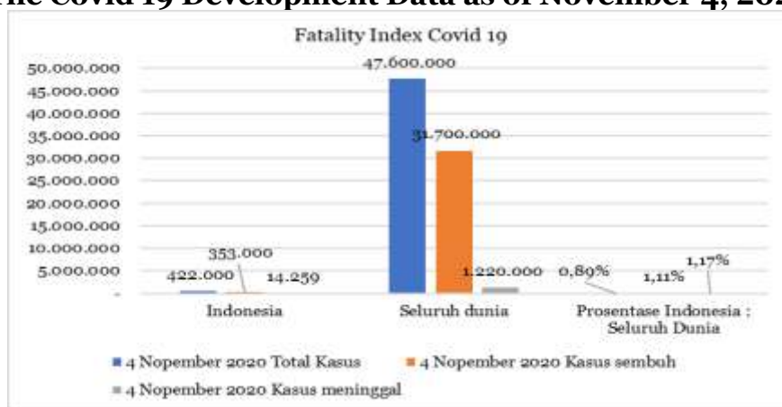
Figure 1 The Covid 19 Development Data as of November 4, 2020