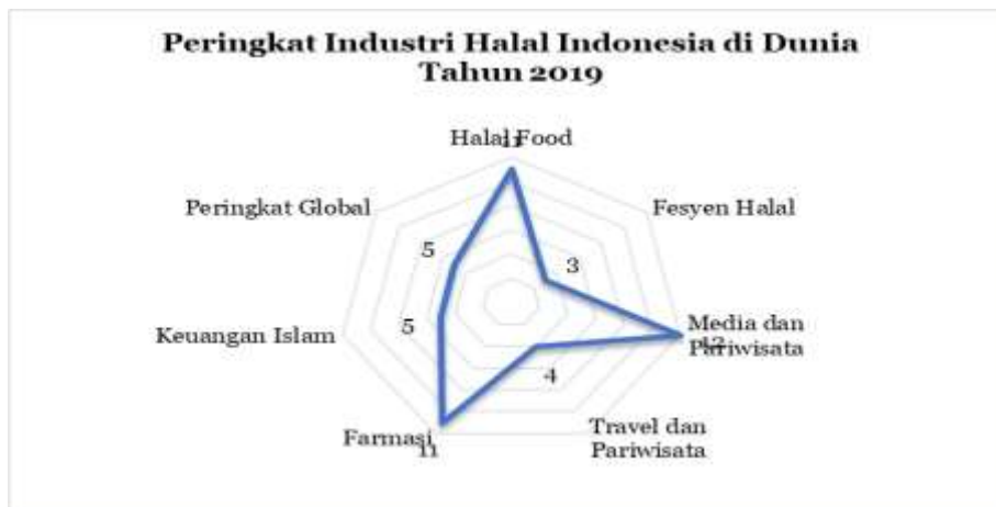
Figure 3 Ranking of Indonesian Halal Industry Sub-Sector in the World in 2019