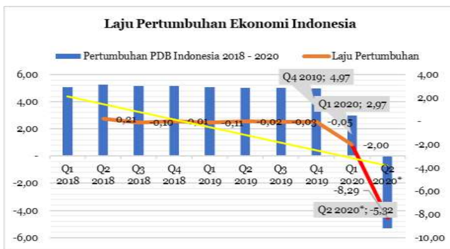
Figure 2 Indonesia's Economic Growth Rate of Q1-Q2 2018-2020

Source: The Indonesian Central Bureau of Statistics (BPS, 2020), processed.