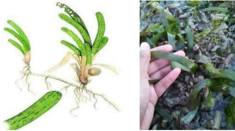
Figure-4. Thalassia hemprichii

Enhalus acroides [5]. This type of seagrass has a smaller morphology of leaves so that it can be more numerous compared to seagrass species that have large leaves [7]. Thalassia hemprichii leaf strands are ribbon-shaped with rounded ends and there are brown lines or patches on the surface. On each stand there are 2-5 leaves with a leaf length of 6-30 cm and a width of 5-10 mm [8].