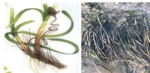
Figure-3. Enhalus acroides

The dominance of Enhalus acroides (Figure-3) in the waters of Tunggul Beach is inseparable from the characteristics of its habitat that lives in sandy or charcoal sand substrates [5], according to the substrate of Tunggul Beach which tends to be charcoal sand, although there are some points with sandy clay or fine sand substrates. Enhalus acroides have thick, wide leaves, and a length of up to 1 meter so that it has room for larger photosynthesis. [6] states the morphology of seagrass species in the form of upright plants with long leaves and large enough, supporting its ability to have high resistance to various environmental conditions. Seagrass Enhalus acroides have larger roots compared to other species and are able to survive in waters that tend to be murky or muddy.