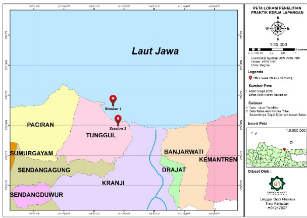
Figure-1. Research site